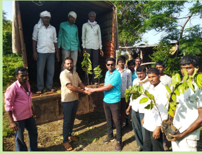
One Million Fruit Trees update