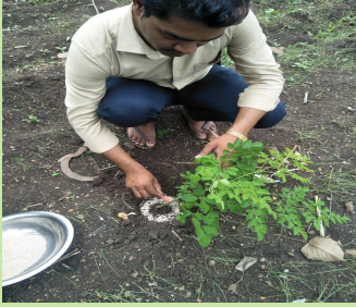
Fruit Tree Saplings and Zeba Distribution