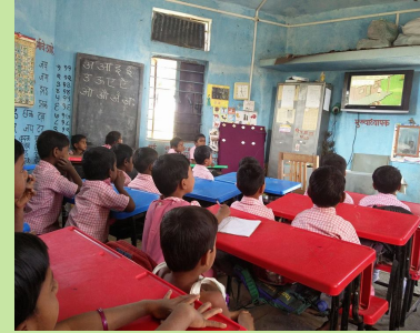
E-Learning set distribution