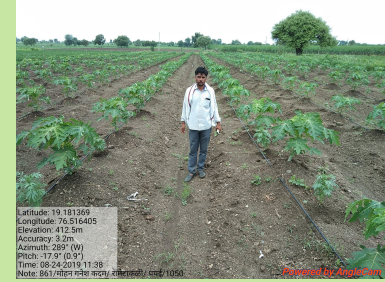
Geo Tagging and Crop Monitoring