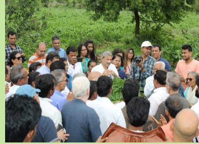
Farm Visit to Understand Horticulture Economics