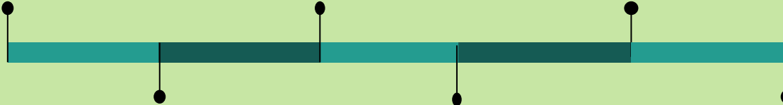
Papaya Sapling Plantation