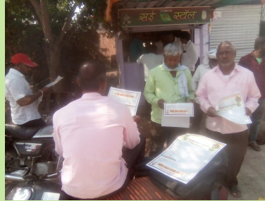
3 Million Fruit Tree Plantation - Outreach Activities