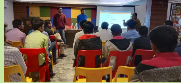
CSC Centres Training