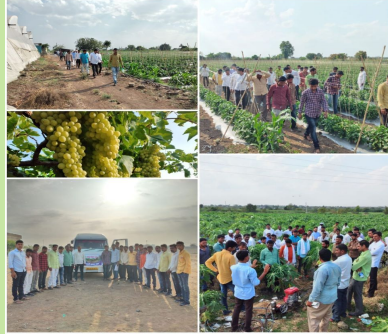
Papaya Farmers' Training