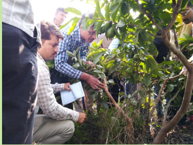
Post Plantation care & Monitoring