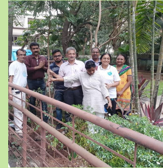
Launch of One Crore Trees Plantation