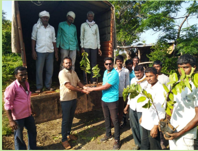
One Million Fruit Trees Target completed